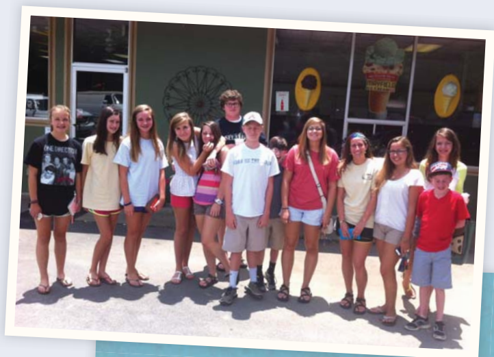
Mystery Lunch Fun!